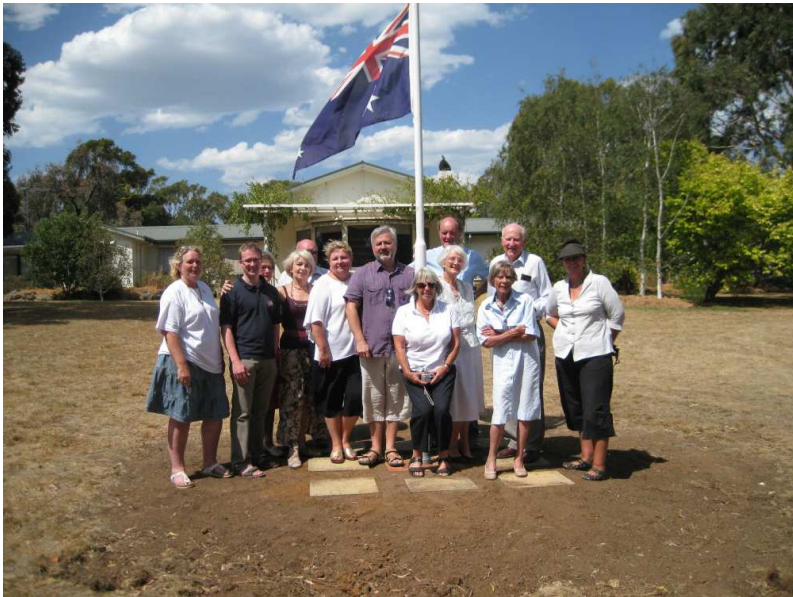
On day four we travelled the famous Great Ocean Road an area of scenic beauty and spectacular views staying overnight in log

cabins and dinning in the nearby restaurant.